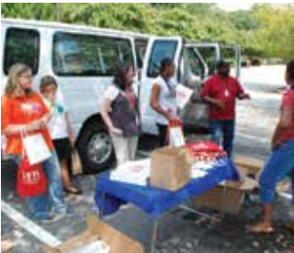
Spotlight on Educational Talent Search..... 3