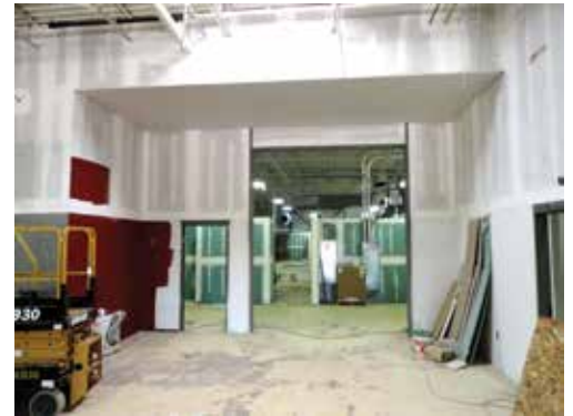
Entrance to the Welding laboratory in the Industrial Technology Center, slated to open Spring Semester, 2013.

In addition to providing much-needed additional space for instruction and updated facilities, the renovated building is being designed to simulate a real-life industrial setting, which will expose our students to the type of environment they will experience in the workplace.