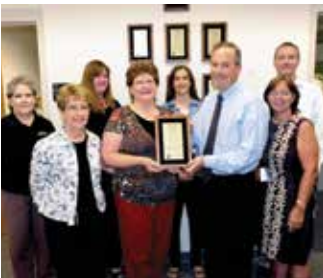
Our College Family..... 4-5, 10-11