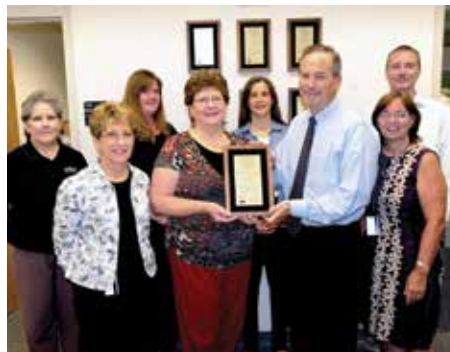
Business Affairs Office Staff

The Business Affairs Office once again has been awarded a Certificate of Achievement for Excellence in Financial Reporting. For the 12 th consecutive year, the Division received the highest form of recognition in the area of governmental accounting and financial reporting from the Government Finance Officers Association of the United States and Canada (GFOA).