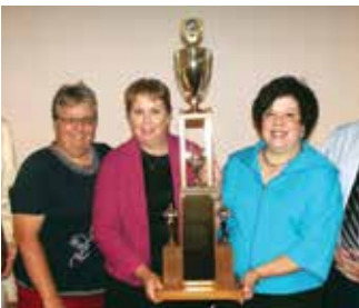
Pre-Pharmacy Advisory Committee Honored..... 12