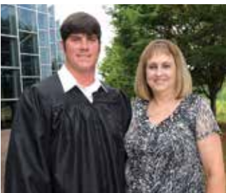
Summer Graduation ..... 15